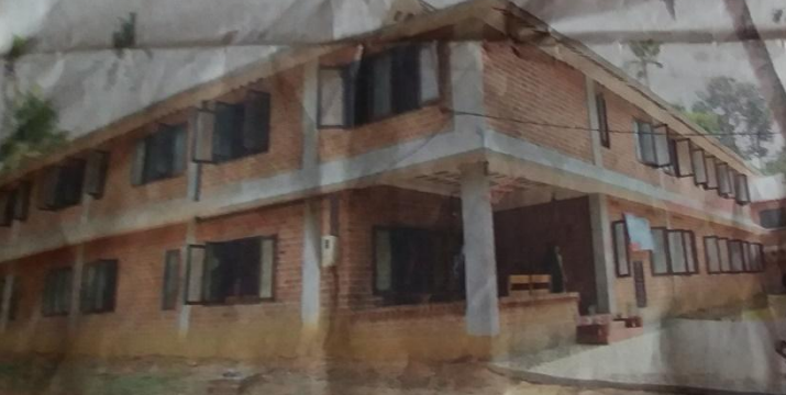
കുടുംബശ്രീയുടെ നേതൃത്വത്തിൽ തയ്യാറാക്കിയ പട്ടണത്തിലെ അന്തരവാസികൾ

കുടുംബശ്രീയുടെ നേതൃത്വത്തിൽ തയ്യാറാക്കിയ പട്ടണത്തിലെ അന്തരവാസികൾക്ക് താല്പര്യമുള്ളവർക്ക് തിരിച്ചയയക്കുന്നതിനുള്ള പദ്ധതികൾ തയ്യാറാക്കിയിരിക്കുന്നു. കൂടുതൽ വിവരങ്ങൾക്ക് കൂടുതൽ പേജിൽ സന്ദർശിക്കുക.