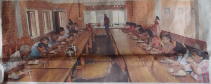
കുടുംബശ്രീയുടെ നേതൃത്വത്തിൽ തയ്യാറാക്കിയ പട്ടണത്തിലെ അന്തരവാസികൾ

കുടുംബശ്രീയുടെ നേതൃത്വത്തിൽ അധികൃതരുടെ സഹായത്തോടെ പട്ടണത്തിൽ നിന്നും തിരിച്ചയയക്കുന്നതിനുള്ള പദ്ധതികൾ തയ്യാറാക്കിയിരിക്കുന്നു. കൂടുതൽ വിവരങ്ങൾക്ക് കൂടുതൽ പേജിൽ സന്ദർശിക്കുക.